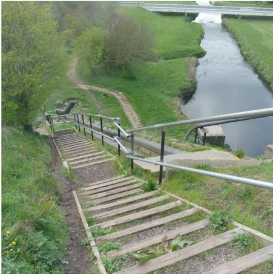
Portage down to the River Tame