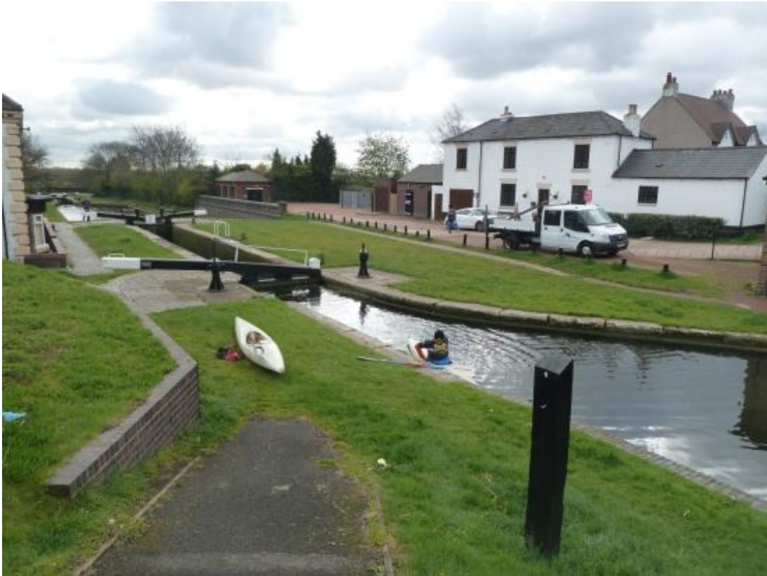
Hamstead Top Lock. The start of the journey.