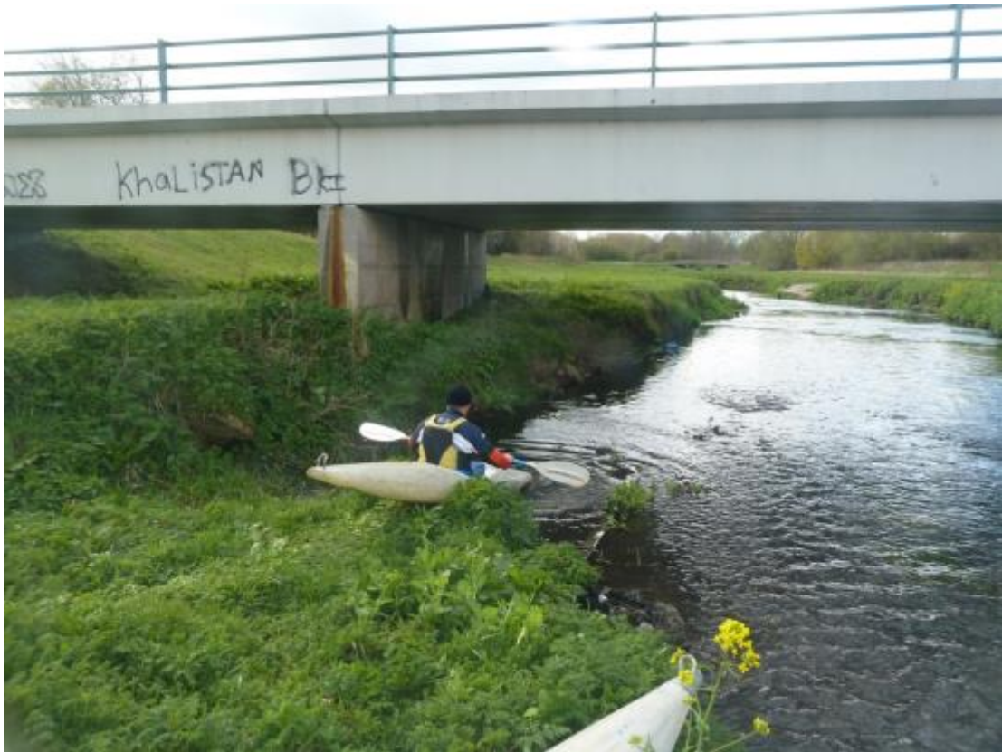
Seal launching onto the Tame.